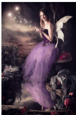
Photo Stoke is a great studio in a quiet location away from busy high streets. They offer all shoot types but try to put a different spin on every genre.

The studio has a traditional high key white background that every studio has but also tries to do something different and unique to create images that will be a talking point on your wall. Louise likes to make all the clients (especially your pooch) feel comfortable and relaxed and will concentrate on them in the shoot to create a realistic portrait and not a photo.